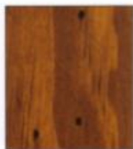
40. Colonial Pine *