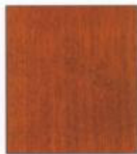
32. Hamptons Cherry