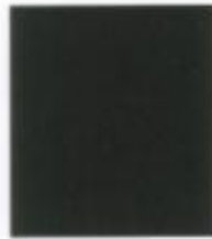
64. Midnight Black

We cannot ship a stone countertop for the armoire kitchen so go to http://www.lghimacs.com/colors_selection.html to select a solid surface color. If you want a stone top for this piece, we can supply the template and your local stone company can fabricate it.