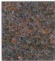
06. Copper Mine