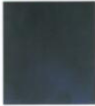
11. Honed Slate