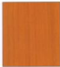
35. Natural Cherry