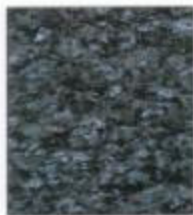
04. Atlantic Green