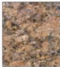
08. Desert Beige