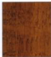
41. Craftsman Oak **

The colors and patterns of the actual material samples may vary slightly from these photographic images that have been reproduced as accurately as possible by high speed printing processes.