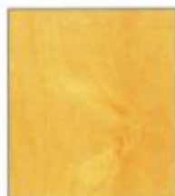
37. Natural Maple