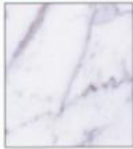
10. White Marble