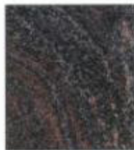
07. Copper Swirl