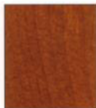
38. Washington Cherry