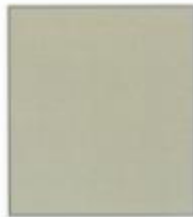
63. Faded Green