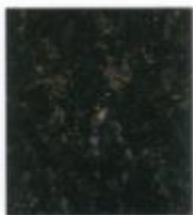
03. Gold Rush Green