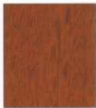
34. Hamptons Mahogany