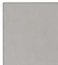
65. Robins Egg

We cannot ship a stone countertop for the armoire kitchen so go to http://www.lghimacs.com/colors_selection.html to select a solid surface color. If you want a stone top for this piece, we can supply the template and your local stone company can fabricate it.