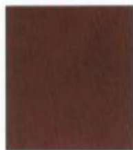
31. Bombay Mahogany