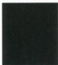
01. Coal Black