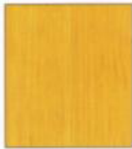
36. Old English Pine